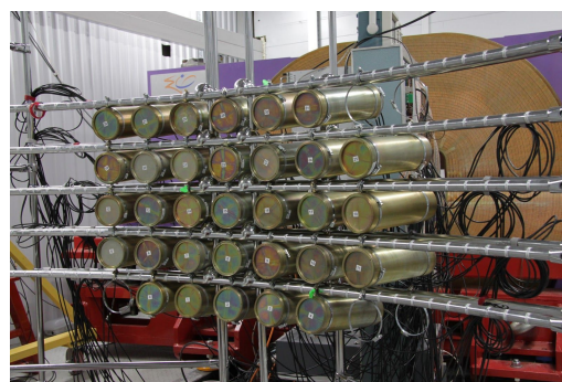
Figure 2: Array of neutron detectors.

Students will get introduction of the principle of work and construction of neutron detectors and of the basic nuclear electronics used in the neutron measurements. Students will get basic knowledge about the main characteristics of a stilbene based neutron detector, such as: threshold of the n- \gamma discrimination, time resolution and neutron detection efficiency. Practical work with neutron detectors (amplitude calibration by gamma sources, measurement of the detector time resolution, determination of the n- \gamma discrimination threshold) is planned. Students will learn procedures for obtaining experimental data using ROOT software.