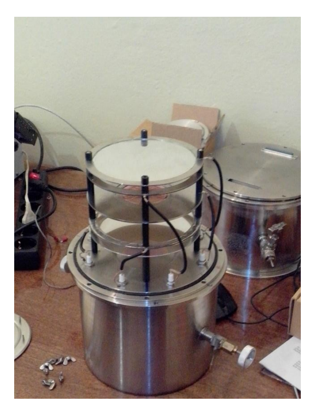
Fig 2. Photograph of twin back-to-back ionization chamber with 235U target mounted on the common cathode.